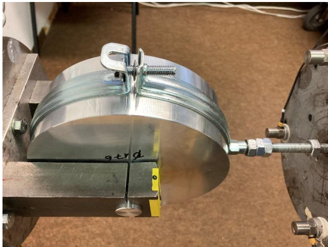
Figure 3. Reference measurement of MP-U (exemplary size of a pipe clamp).

\\S-muc-fs01\allefirmen\WP\Proj\145\M145014\M145014_11_BER_1E.DOCX:04. 03. 2022